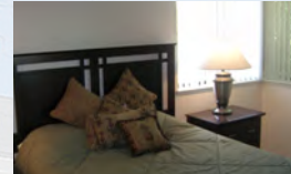
FLS Citrus Apartment