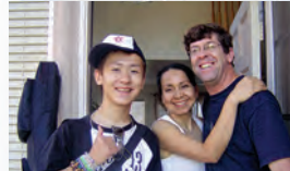
FLS LVI Homestay