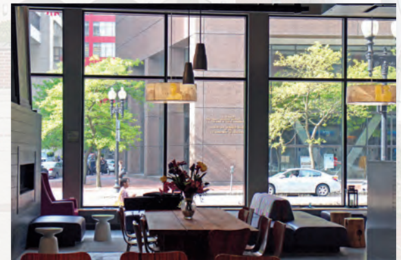
FLS Boston Dormitory