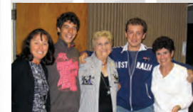
FLS Chestnut Hill Homestay