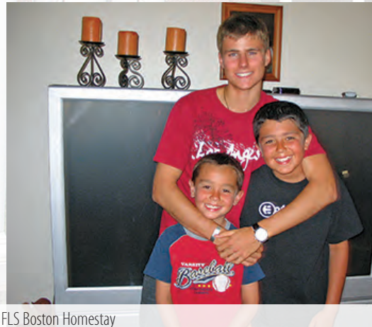
FLS Boston Homestay