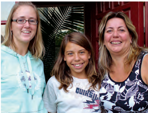
FLS Saddleback Homestay

Students are expected to leave their housing by noon on the day after their program ends. Students who request to leave housing after noon on Saturday should note that such requests are not guaranteed, and if granted will incur an additional housing charge.