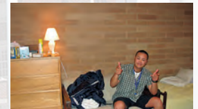
FLS Chestnut Hill Dormitory