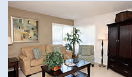
FLS Saddleback Apartment