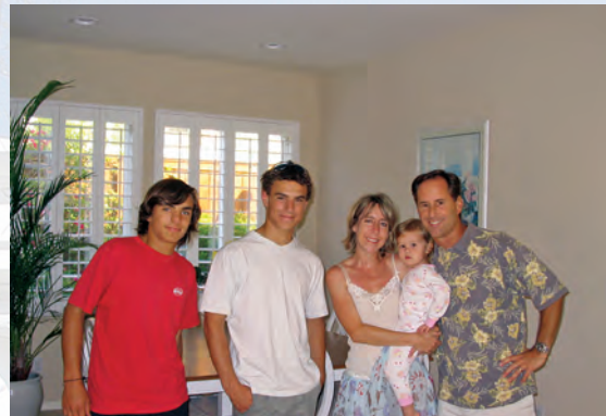
FLS Citrus Homestay